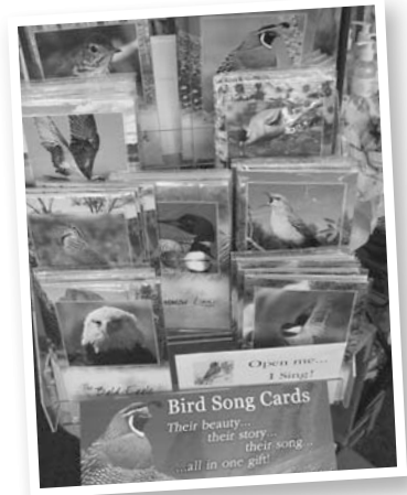
Wild-Cards – Surprise someone with a singing Wild-Card! Beautiful photography with accurate song when opened.