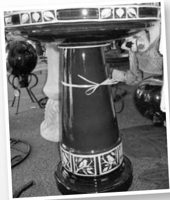
New Burley Clay Birdbaths – Made in America. Beautifully done.