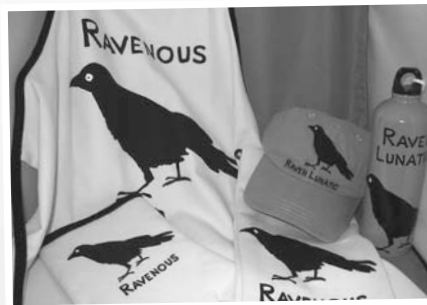
For the B-B-Q'er – Ravenous apron, oven mit, towel, and potholder.