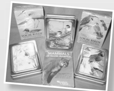
Deal Me In – Playing Cards with birds on them