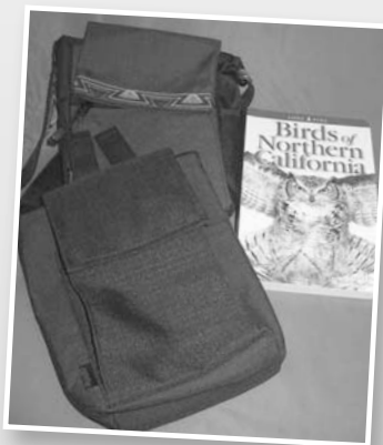
Pouches – New Pajaro pouch for field guides