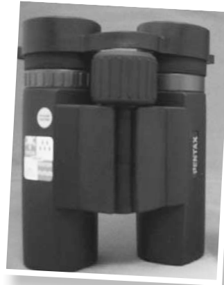
New 9x28 DCF LV Pentax binoculars – Lightweight, Great Price, Great Image!