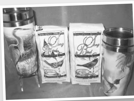
Mugs – Thermal mugs and songbird coffee beans for the commuter