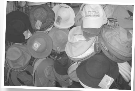
Hats and Caps – Protect yourself with a UPF50 hat from Sunday Afternoon, Dorfman Pacific, and Wallaroo. – Raven Lunatic Caps